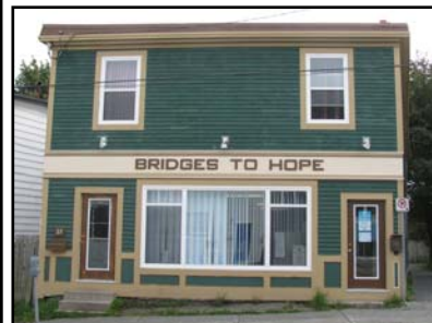
The Pantry at Bridges to Hope